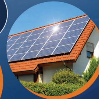
Power / Energy